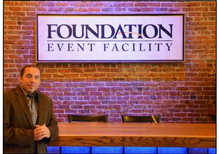
The FOUNDATION Event Facility provides catering for events at the facility, quality sound systems, high-tech lighting and HD television provided by BTES.

FOUNDATION events include live music and public events, such as the first Halloween Social in October and the first Annual Pancake Breakfast with Santa in December, with an on-site Santa's Workshop.